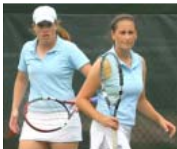
2007 NCAA Doubles Champions