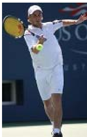
2006 Wimbledon Doubles Semfinalist